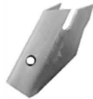
COIL TINE MUD SHIELD PCT-MUD-1 $9.50